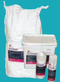
Vazor® DE Powder Contains: Silicon Dioxide