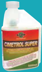
Cimetrol Super Contains: Contains: 25% cypermethrin, 10% tetramethrin, 20% piperonyl butoxide, 1% pyriproxyfen