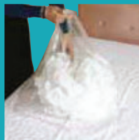
Water Soluble Laundry Bags