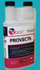
Vazor® Provecta A 'molecular-mesh' non-residual product to spray directly at bedbugs, resulting in physical control by immobilisation, as an important resistance management tool.