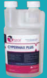
Vazor® Cypermax Plus Contains: 10% w/w cypermethrin and 5% w/w tetramethrin.