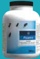
Ficam W Contains: 80% w/w bendiocarb