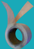
Agrisense Bedbug Roll