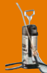
Gloria 5 Ltr