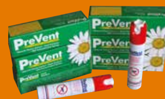
Prevent Spray - Insect Repellent Contains 1% w/w pyrethrins synergised by piperonyl butoxide