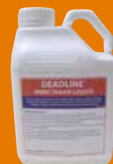
Deadline Insectaban Liquid Contains 0.23% w/w permethrin