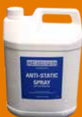
Anti Static Spray