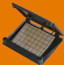
AF Insect Monitor