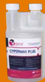
Vazor® Cypermax Plus Contains 10% w/w cypermethrin and 5% w/w tetramethrin