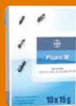
Ficam W Contains 80% w/w bendiocarb