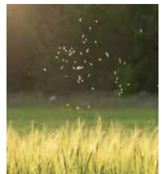
Sites that are very wet, for at least part of the year, may favour the development of biting midges, family Ceratopogonidae.