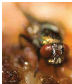
Filth and debris left by the floodwaters create excellent breeding conditions for houseflies other flies and insects associated with decaying organic matter.