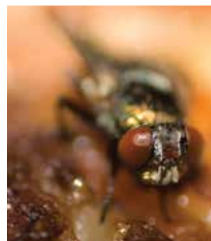
Filth and debris left by the floodwaters create excellent breeding conditions for houseflies other flies and insects associated with decaying organic matter.