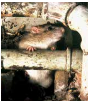
Unwelcome rodents may cause damage to property directly by gnawing or indirectly by depositing faeces and urine.

After flooding, many rodents are displaced from their natural habitat. The rodents will then find areas that provide food, water and harbourage. Inevitably, rodents enter houses, sheds, barns, and other buildings.