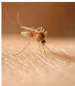
Flooded cellars in particular, can harbour Culex pipiens biotype molestus , a human-biting mosquito.