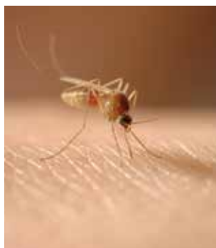
Flooded cellars in particular, can harbour Culex pipiens biotype molestus , a human-biting mosquito.