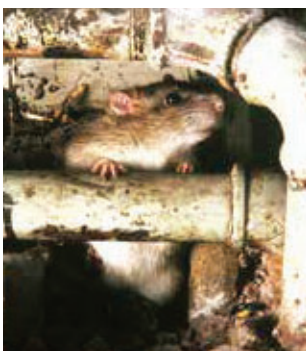
Unwelcome rodents may cause damage to property directly by gnawing or indirectly by depositing faeces and urine.

After flooding, many rodents are displaced from their natural habitat. The rodents will then find areas that provide food, water and harbourage. Inevitably, rodents enter houses, sheds, barns, and other buildings.