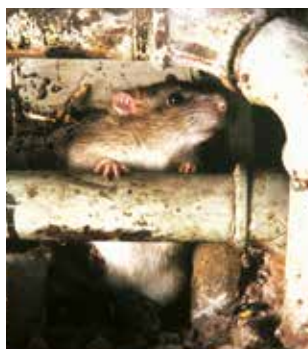
Unwelcome rodents may cause damage to property directly by gnawing or indirectly by depositing faeces and urine.

After flooding, many rodents are displaced from their natural habitat. The rodents will then find areas that provide food, water and harbourage. Inevitably, rodents enter houses, sheds, barns, and other buildings.