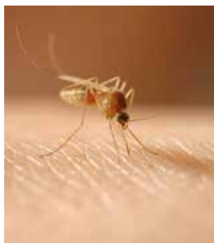
Flooded cellars in particular, can harbour Culex pipiens biotype molestus , a human-biting mosquito.