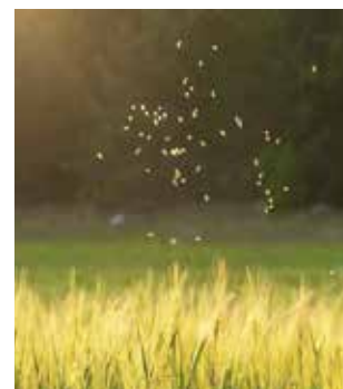
Sites that are very wet, for at least part of the year, may favour the development of biting midges, family Ceratopogonidae.