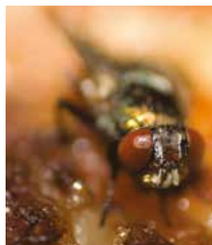
Filth and debris left by the floodwaters create excellent breeding conditions for houseflies other flies and insects associated with decaying organic matter.