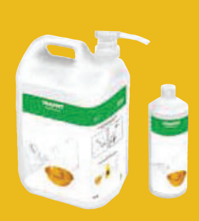
Fly & Wasp Bait

Contains: 0.27% Permethrin, 0.11% Tetramethrin