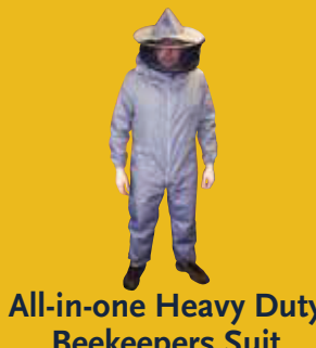
All-in-one Heavy Duty Beekeepers Suit